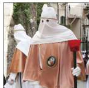
6 - St. Mary Graces 1934