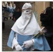
15 - St. Mary the New Woman 1403