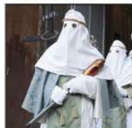
7 - St. Joseph 1933