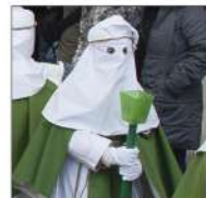
4 - St. Mary of Valverde 1935