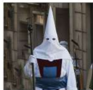
3 - Holy Crucifix of Pergusa 1973