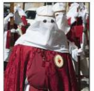
11 - Sacred Heart of Jesus 1839