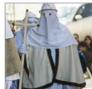
8 - St. Mary of the Rosary 1932