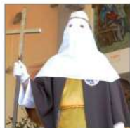
2 - St. Anne 2011