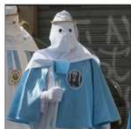
10 - St. Mary of the Visitation 1874