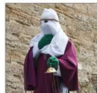
12 - Holy Spirit 1800