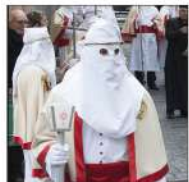
5 - Blessed Sacrament 1935