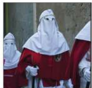
1 - Most Holy Passion 1660