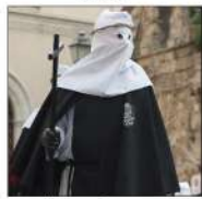
14 - Holy Souls in Purgatory 1615