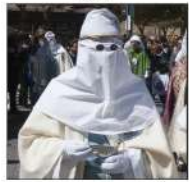
13 - St. Mary Immaculate 1754