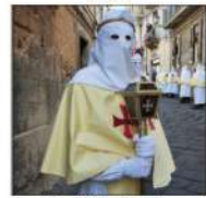
16 - Holy Savior 1261