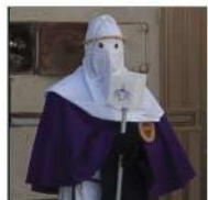
9 - Our Lady of Sorrow 1875